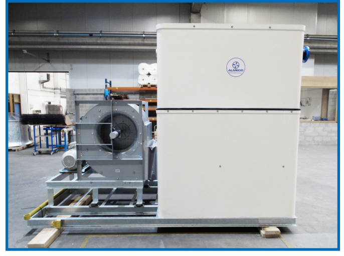
Illustrations are for illustration purposes only and may differ.